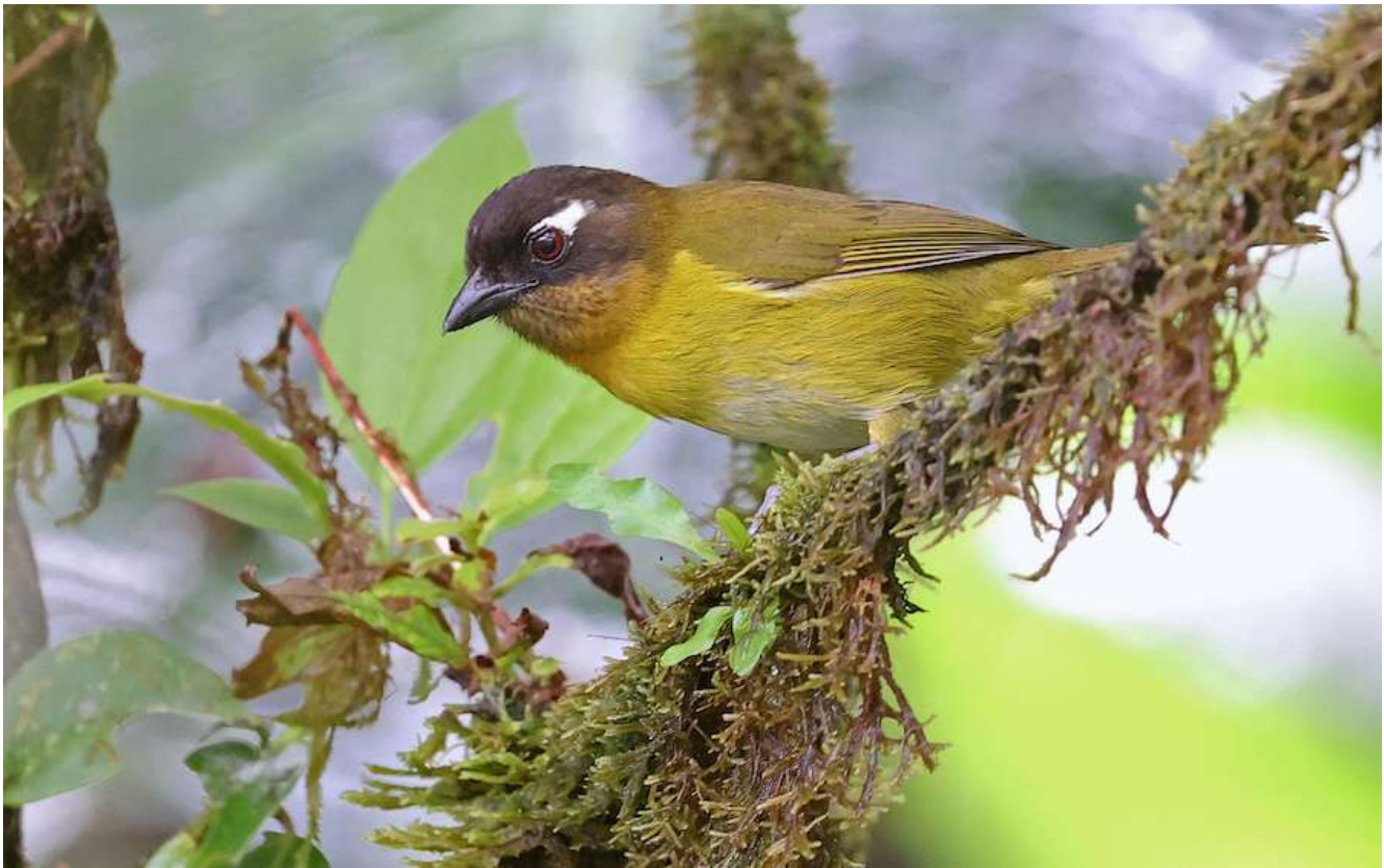
Common Chlorospingus

March 1, Day 10: Departure for Home. Participants can use the hotel's complimentary shuttle service to Tocumen International Airport for morning or afternoon flights home.