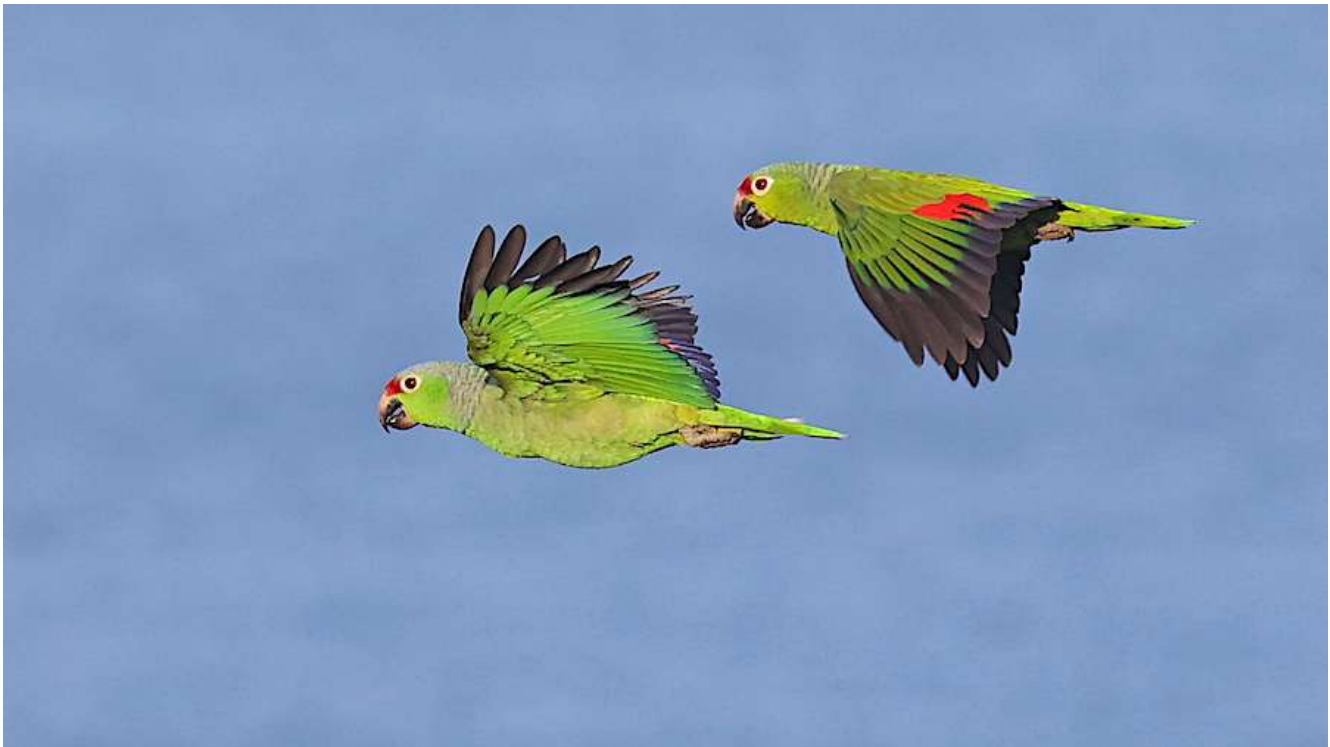
Red-vented Parrots

and numerous tanagers including Speckled, Bay-headed, Emerald, and Silver-throated. Mammal sightings on this action-packed day might include sloths, Mantled Howler Monkeys, and Red-brocket Deer.