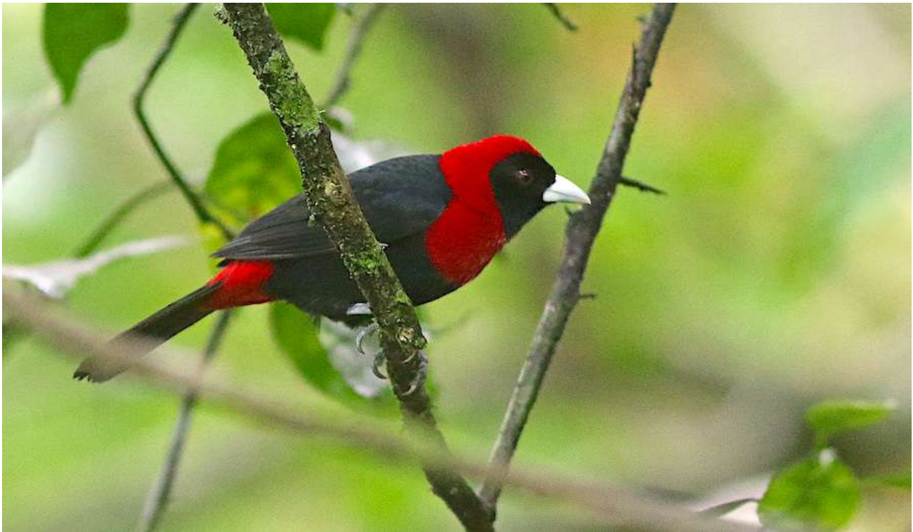
Crimson-collared Tanager

abound on both sides of the canal, and we will proceed very slowly, with many stops, as we bird our way up to the mouth of the Changuinola River.