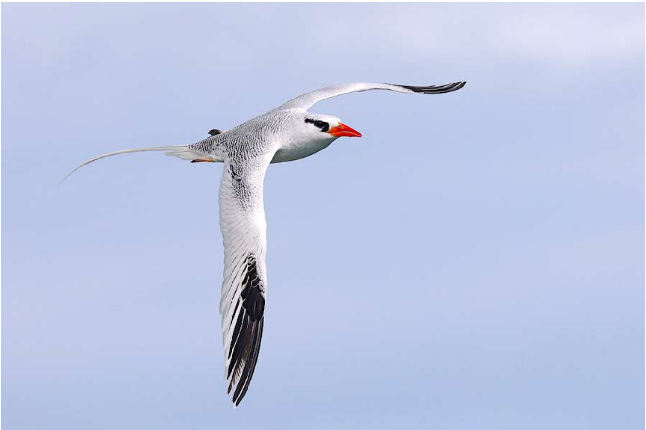
Red-billed Tropicbird

February 25, Day 6: Tierra Obscura and Tranquilo Bay. After an early breakfast, we'll travel by boat eight miles to the town of Hope Well and explore a new road (Buena Esperanza Road) through the Tierra Obscura Corregimiento, providing access to a long list of birds. In this area, the overstory trees are very tall and old, and the new road edge provides access to a rich array of forest and edge species. Some of the many birds we may find along this road include Pied Puffbird, Yellow-throated and Keel-billed toucans, Pale-billed and Lineated woodpeckers, Wedge-billed and Cocoa woodcreepers, Purple-throated Fruitcrow, Masked and Black-crowned tityras, Cinnamon and White-winged becards, Black-capped Pygmy-Tyrant, Long-tailed Tyrant, Black-chested Jay, Montezuma and Chestnut-headed oropendolas, Giant Cowbird, and Thick-billed Seed-Finch. This is also a good area to find the beautiful Green-and-black Poison Dart Frog as well as a wonderful variety of butterflies, and often sloths. We will return to the lodge for lunch and siesta. In the afternoon, we'll have options to bird trails on the property, do some snorkeling on the wonderful coral reefs, kayak around the mangroves and reefs, visit the bat cave, or simply relax on the cabana porches.