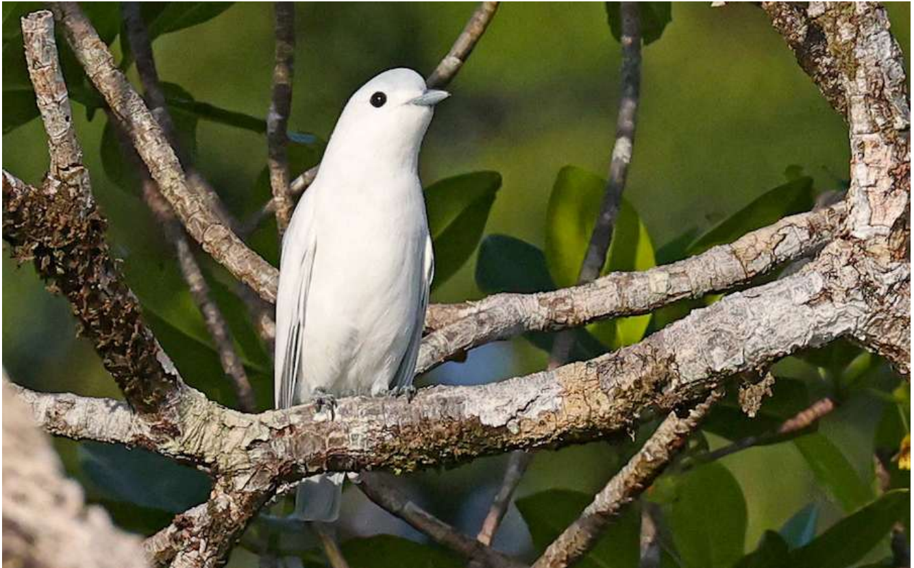
Snowy Cotinga

Panama is without doubt one of the premier birding destinations in the Neotropics. It is famous for its rare combination of easy access to extensive, high-quality habitat, good food and water, comfortable to luxurious accommodations, and high diversity of birds—all within a compact geographic area. While ideal for those new to the Neotropics, western Panama's Bocas Del Toro Province offers numerous local specialties for those who have birded elsewhere in the country. Some of the special birds that we'll search for on this itinerary include Short-tailed Nighthawk, Spot-fronted and White-chinned swifts, 15+ hummingbirds, Uniform Crake, Collared Plover, Red-billed Tropicbird, six kingfishers, Prong-billed Barbet, Northern Emerald-Toucanet, Collared Araçari, Yellow-throated & Keel-billed toucans, Black-chested Jay, four parakeets & six parrots, four manakins, Purple-throated Fruitcrow, Snowy Cotinga, 20+ tanagers, Nicaraguan Seed-Finch, and many more species.