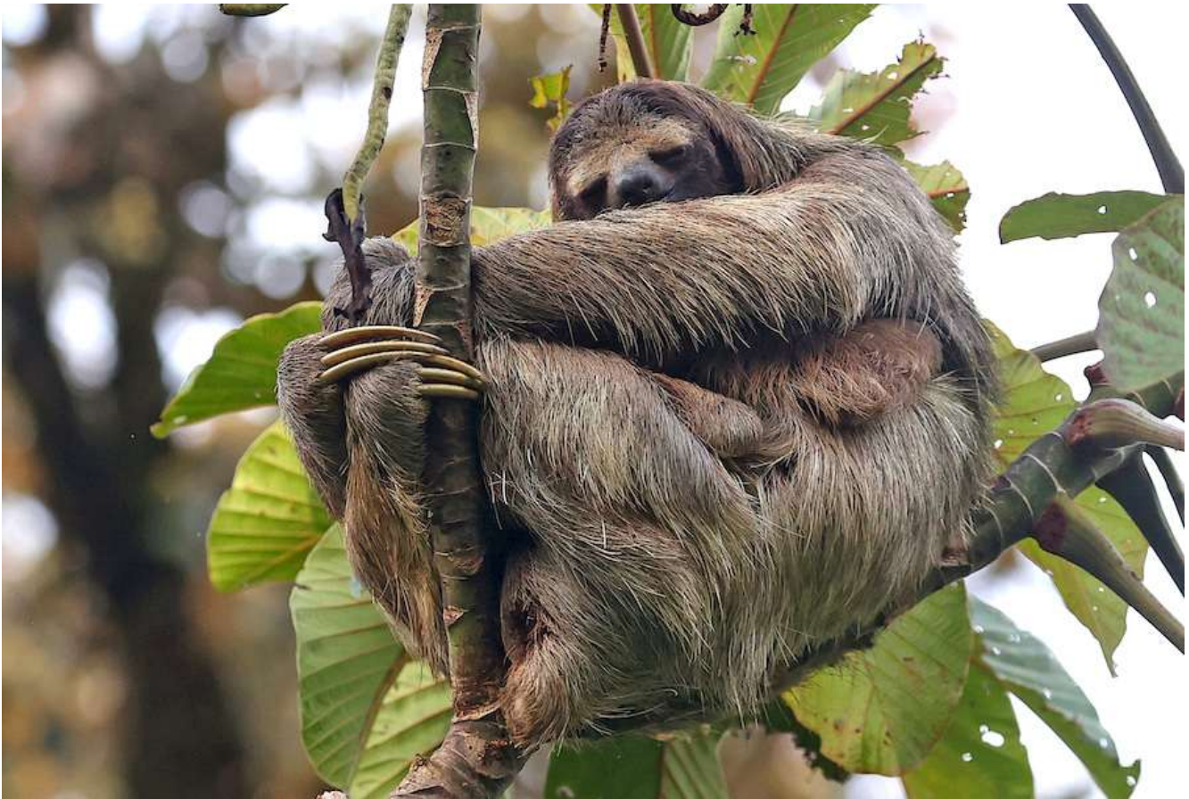
Brown-throated Three-toed Sloth

Northern Emerald-Toucanet, Sulphur-winged Parakeet, Silvery-fronted Tapaculo, Red-faced Spinetail, Azure-hooded Jay, Orange-billed and Slaty-backed nightingale-thrushes, Tawny-capped and Elegant euphonias, Common and Yellow-throated chlorospingus, Tropical Parula, Slate-throated Redstart, and numerous tanagers including Blue-and-gold, Spangle-cheeked, Bay-headed, and Silver-throated. We will enjoy a picnic lunch overlooking the beautiful Lake Fortuna, giving us the chance to watch the sky for raptors. We will return to the lodge by late afternoon, in time to enjoy drinks and appetizers on the veranda as we discuss our favorite sightings of the day.