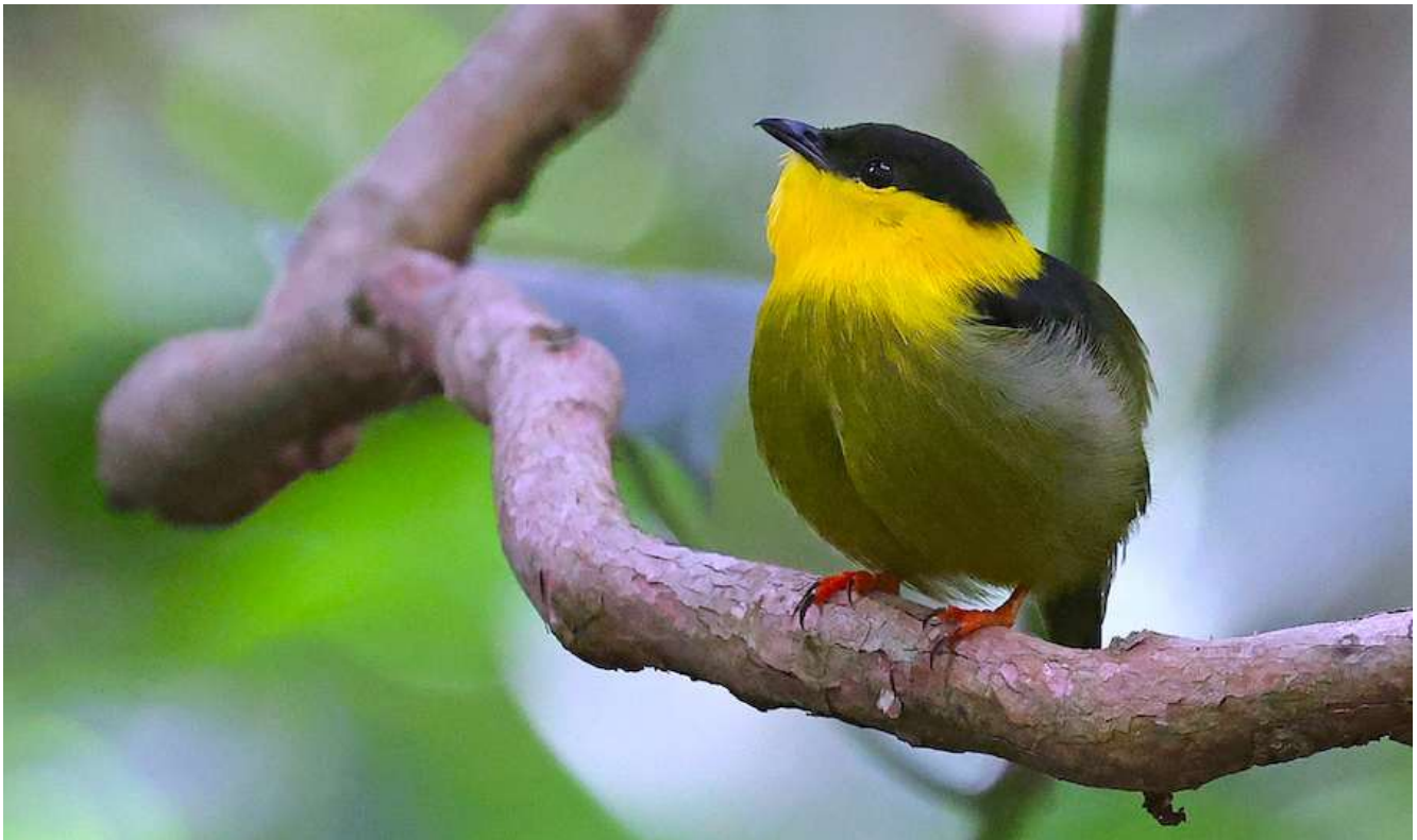
Golden-collared Manakin