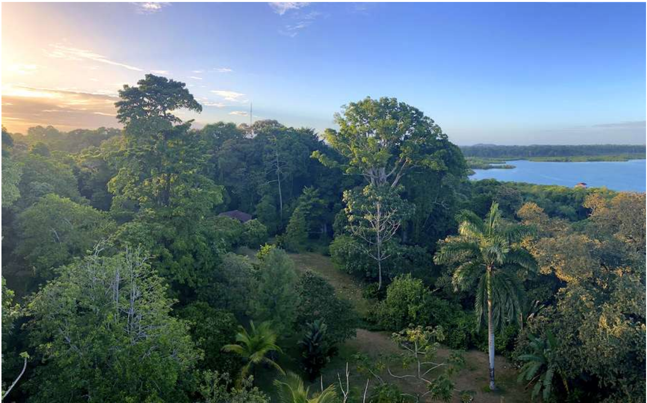
View from the tower at Tranquilo Bay

and Three-toed sloths, White-faced Capuchin, Panamanian Night Monkey, Nine-banded Armadillo, Crab-eating Raccoon, Central American Woolly Opossum, Grey Four-eyed Opossum, and Northern Tamandua. We will plan to be up on the deck of the six-story high observation tower near our cabanas by 5:00 p.m. this afternoon. This structure provides us with a view of the treetops in the surrounding forest as well as the mangroves and Caribbean Sea. Small birds feeding in the canopy of adjacent tall trees are much easier to see from up here. Some of the Red-lored Parrots going to roost often fly so close we could almost touch them.